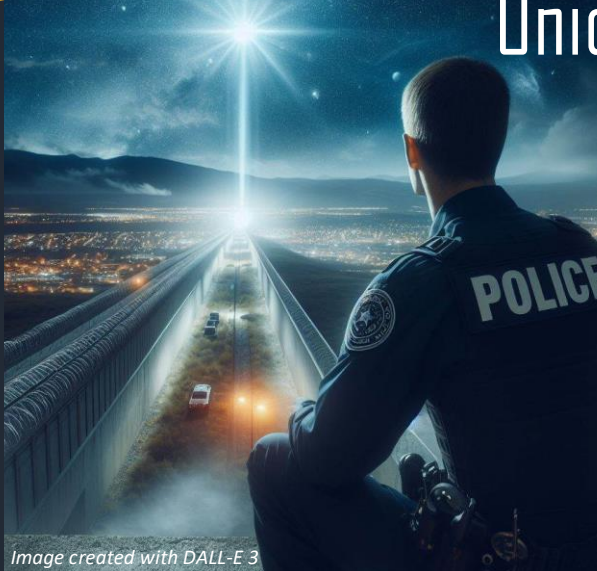
Image created with DALL-E 3