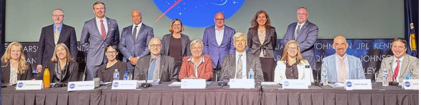
Group Photo: Members of the NASA Unidentified Anomalous Phenomena Independent Study Team